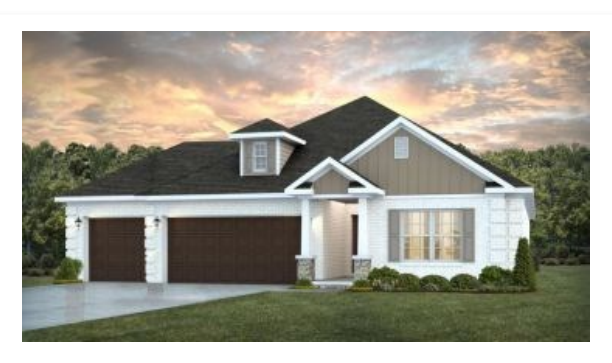
Rate Advertised: 5.875% (APR 6.239%)*

Thompson Homes has participated in the CMG Financial Build & Lock Program to reduce the rate for 3345 Ralston Drive, Evansville, IN 47715